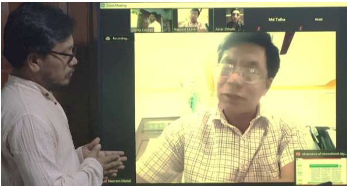
Top: female positive inmates of the COVID Care Centre at Lilong Haoreibi College women's hostel take on the food items on banana leaves offered by the students union of the college